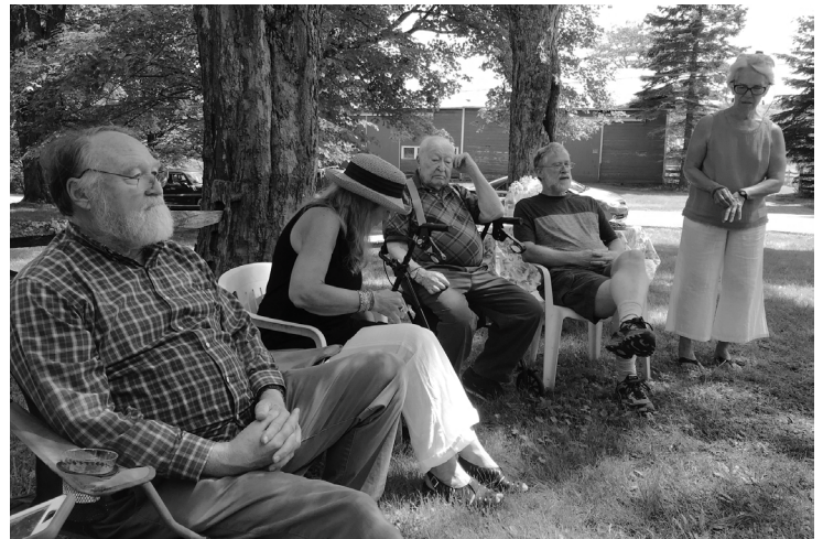
Memory Circles: Shared Stories of Old Canaan